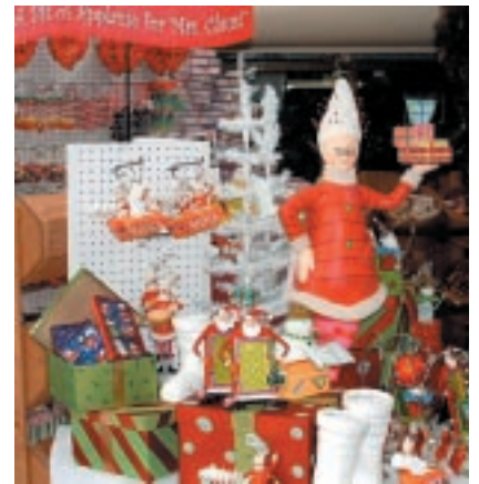
Frontop: blonglass oranents, etched glasshuricares, berriedwæths and garlands; the oranents used to decrate the Love Tree are located alongside it; Mrs. Classpæsides over her lighthærted display.