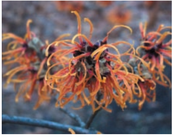
Hamamelis jelena, above, and Hellebores niger.

Hellebores of almost all sorts stay green in the winter. If you want holiday blooms the only one that would possibly oblige you is the Christmas rose, Helleborus niger, and only in a freek year. Most of the others are early-Spring bloomers. But they do stay green. They range from the large, toothed leaves of H. x orientalis (the essiest), to the taller but finely dissected H. foetidus, and the subtly variegated hybrids with H. argutifolius in their ancestry. Wintergreen, sold potted for the holidays, is prettier outside than in. Try some. It has berries like little half-inch apples, of a fire engine red, on a plant maybe four inches tall and a deep green.