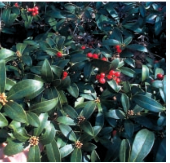
Skimmia, above, and Red Twig Dogwood (Comus stolonifera).

I end this Christmas article with a plant straight out of